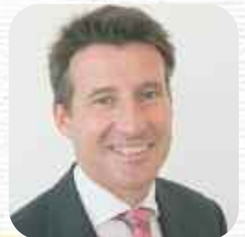
Lord Sebastian Coe KBE

20.00: Delegates depart for a traditional Spanish evening and entertainment at Posada De La Villa Restaurant